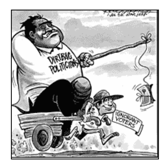
Illustration 9: Philippine Star, July 1, 2002.