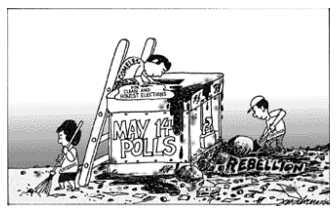
Illustration 5: Philippine Daily Inquirer, May 7, 2001.