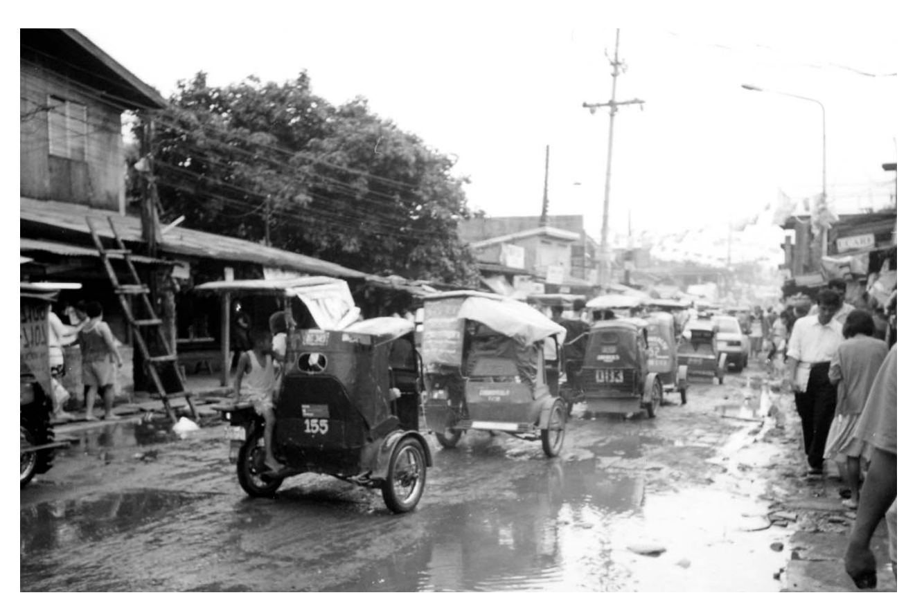
Illustration 8: Main commercial street in Barangay Commonwealth.