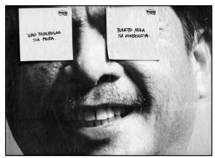
Illustration 3 : 3M public service ad, May 2001. "Don't be blinded by money. Vote with your conscience."