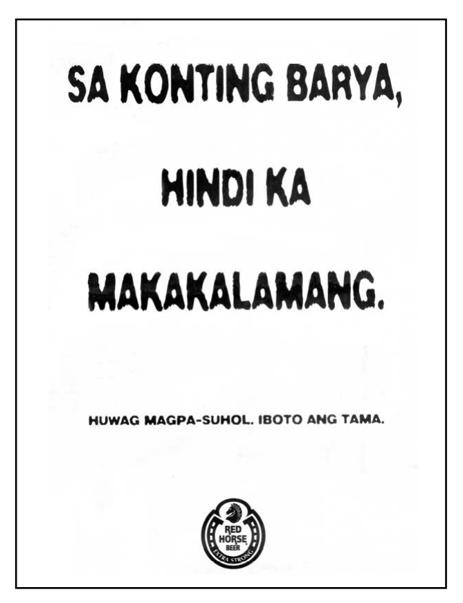
Illustration 2 : Red Horse Beer public service ad, May 2001. "A little pocket change won't put you ahead. Don't ask for a bribe. Vote for a good candidate."