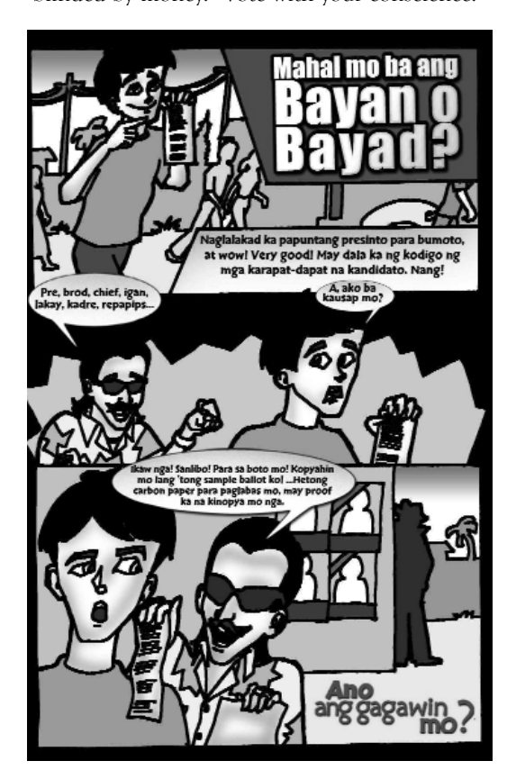
Illustration 4: Namfrel public service ad, May 2001. "Do you love the country or the money? You're walking to your precinct to vote, and wow, very good, you've brought a list of worthy candidates when.... Vote buyer: 'hey buddy, brother, friend, chief, etc.' Voter: 'What? You talking to me?' Vote buyer: 'Yeah you. 1000 pesos for your vote. Just copy this sample ballot. Here's carbon paper so that when you come out you have proof that you copied