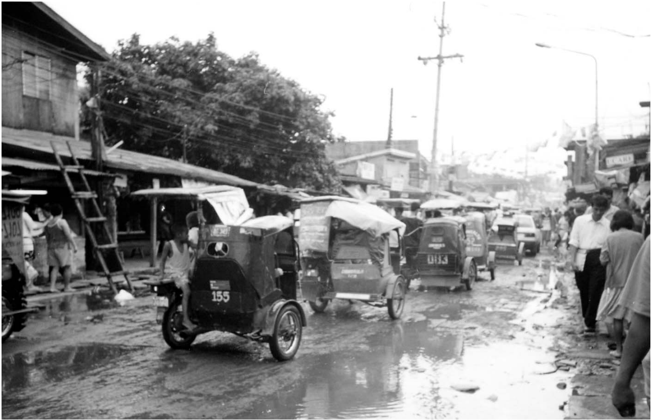
Illustration 8: Main commercial street in Barangay Commonwealth.