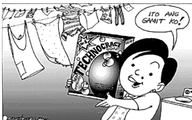
Illustration 7: Philippine Daily Inquirer , July 24, 2001. President Gloria Macapagal Arroyo saying “This is what I use!”