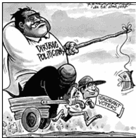
Illustration 9: Philippine Star , July 1, 2002.