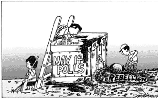
Illustration 5: Philippine Daily Inquirer , May 7, 2001.