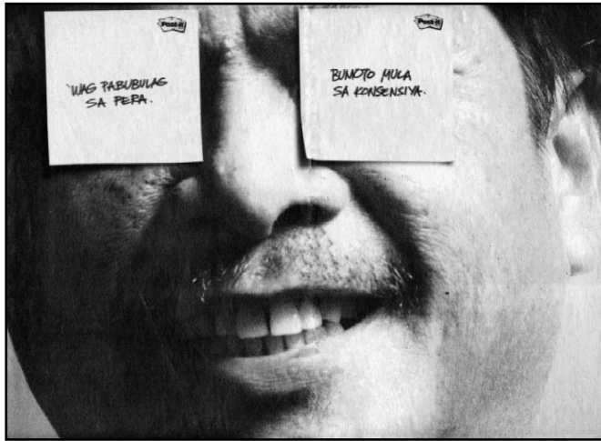
Illustration 3: 3M public service ad, May 2001. “Don’t be blinded by money. Vote with your conscience.”