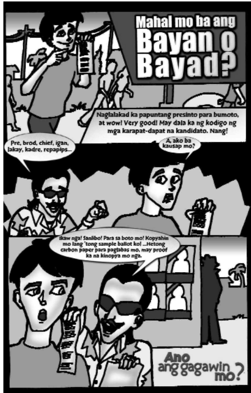
Illustration 4: Namfrel public service ad, May 2001. “Do you love the country or the money? You’re walking to your precinct to vote, and wow, very good, you’ve brought a list of worthy candidates when... Vote buyer: ‘hey buddy, brother, friend, chief, etc.’ Voter: ‘What? You talking to me?’ Vote buyer: ‘Yeah you. 1000 pesos for your vote. Just copy this sample ballot. Here’s carbon paper so that when you come out you have proof that you copied it.’ What will you do?”